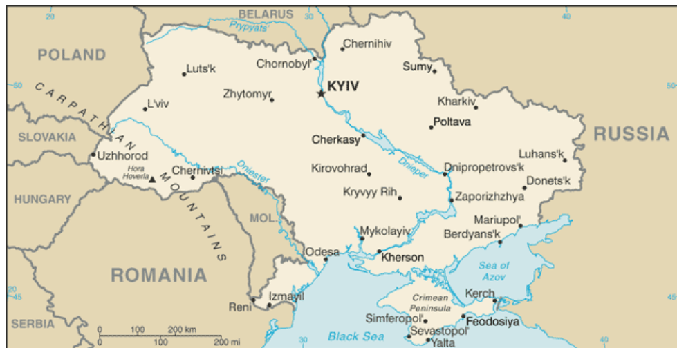
Figure 3. Map of Ukraine