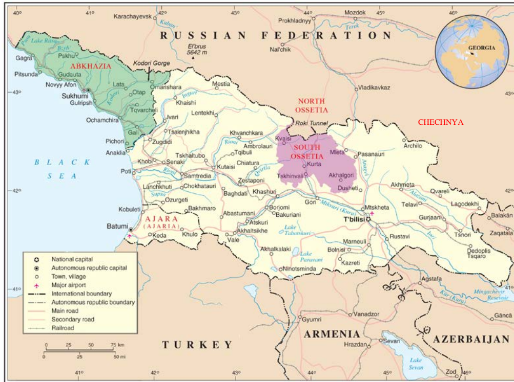
Figure 2. Map of Georgia with Breakaway Regions Abkhazia (Green) and South Ossetia (Purple)

Created by “ChrisO” at UN Cartographic section and available in public domain at: https://upload.wikimedia.org/wikipedia/commons/9/91/Georgia_high_detail_map.png .