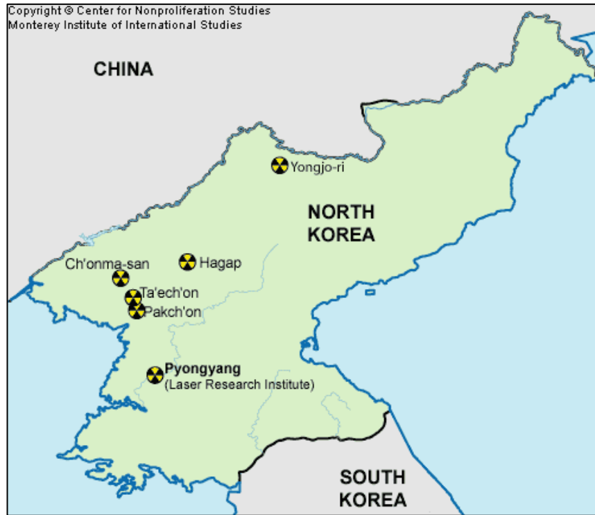
Figure 2. Suspected North Korean Uranium Enrichment Sites 23

nuclear capability North Korea possessed. Three months later, North Korea publicly stated it possessed nuclear weapons, threatening the possibility of exporting nuclear materials.