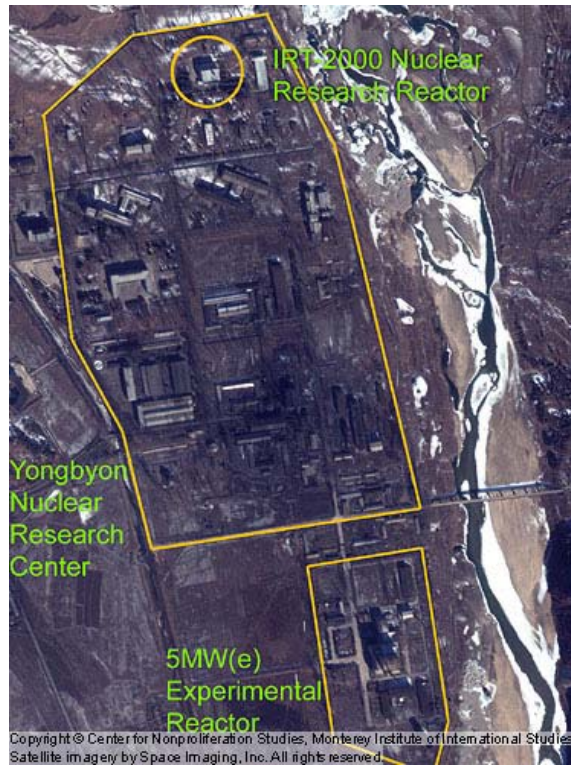
Figure 1. Yongbyon Nuclear Facility, North Korea 20

separated enough plutonium for anywhere from one to five nuclear weapons. 21 By the time the crisis had begun, intelligence reports stated North Korea had covertly attempted to acquire an uranium enrichment program (see Figure 2), and had been trying to do so for over two years, clearly in violation of the Agreed Framework. 22 North Korea has publicly refuted those claims. In January 2003, North Korea informed the IAEA and the U.N. Security Council that Pyongyang was withdrawing from the Non-Proliferation Treaty. There was still much debate within the intelligence community on what type of