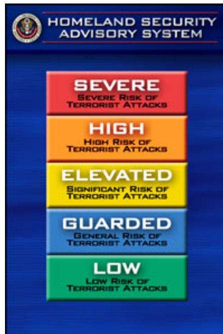
Figure 1. Homeland Security Advisory System (From: Homeland Security, 2008b)