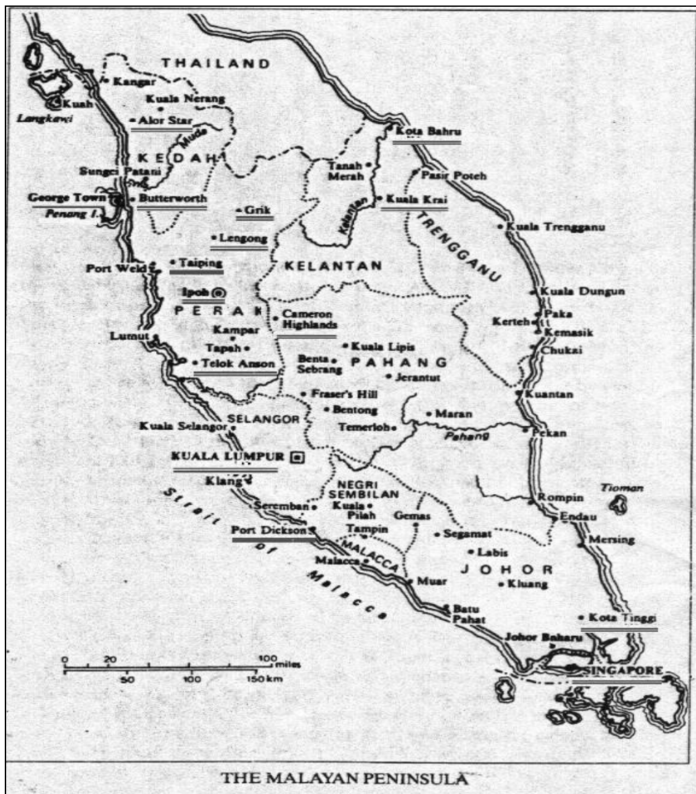
Table 1. Map of Malayan Peninsula during period of Malayan Emergencies.

thousands of people from jungle areas where they were vulnerable to guerrilla intimidation to the relative security of new villages. Britain also prepared the local people for independence, which was granted in August 1957 when Malaya became Malaysia. By 1960, the 1 st Emergency was practically over and, indeed, the Malaysian government declared the end of the Emergency in July, 1960. The remnants of the once formidable communist forces remained mostly in secluded areas near the border with Thailand. 2