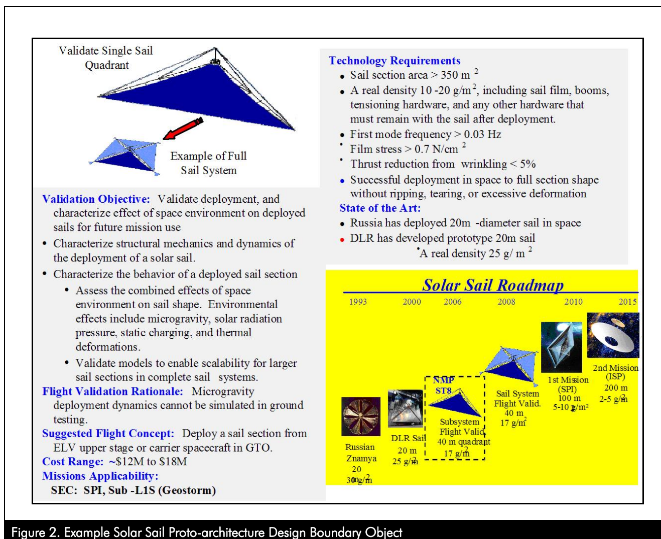
Figure 2. Example Solar Sail Proto-architecture Design Boundary Object

Each design candidate was modeled as a proto-architecture to establish an initial proof of design concept. The NMP staff used the term ‘concept’ to mean a design project or idea. Each concept was represented by a ‘quad-chart’. One NMP technologist expressed this as follows: “We create a quad-chart for every concept. It has all of the information we need on one page. It has taken us 8 years to get them right.”