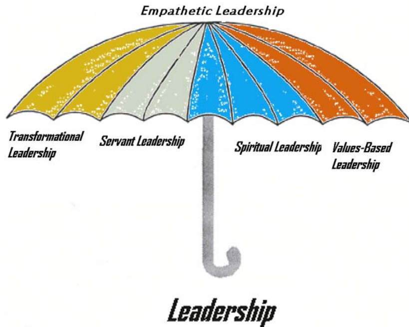
Figure 1. Leadership Umbrella