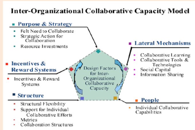
Figure 3: ICC Model

The ICC model has three factors in the domain of Purpose and Strategy: (1) Felt Need is the recognition of interdependence with others and the acknowledged need to collaborate to effectively accomplish missions and goals. Felt Need often comes from perceptions of a shared challenge or opportunity. (2) Strategic Actions include goals for collaboration, demonstrated senior leadership commitment, and willingness to consider other organizations' interests in planning. (3) Resource Investments (e.g., budget, personnel) addresses the degree that investments are made to enable effective collaboration.