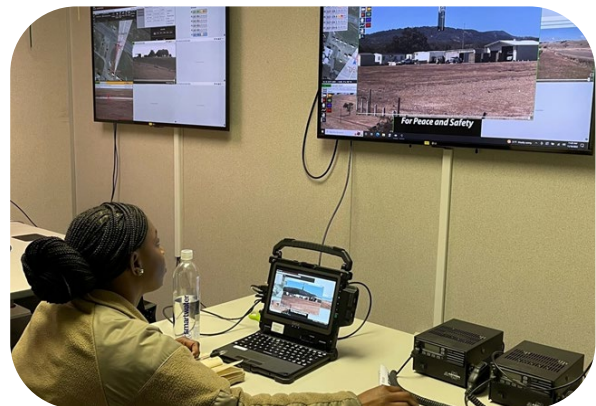
Members of 820 th Base Defense Group put various systems through their paces as they explore capabilities for INDOPACOM applications.