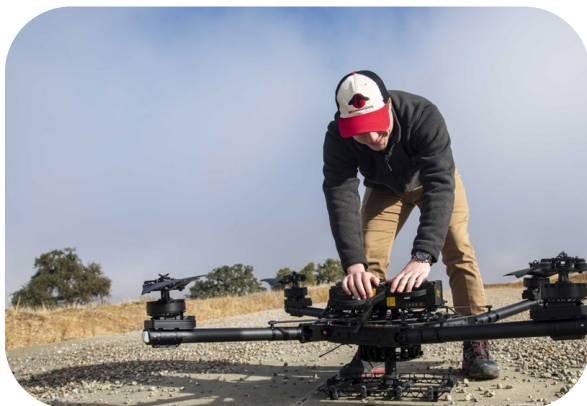
E-02: Ravenworks prepares one of its UAS for flight.