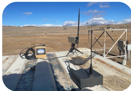
F-01: Gantz-Mountain MT-5 explored ways to optimize power solutions to extend its smart surveillance systems ops.