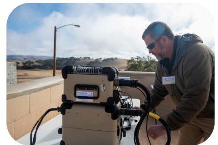
K-03: Bren-Tronics set up their austere battery packs for uninterrupted power.