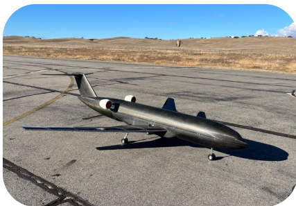
A-04: M4 Engineering, Inc experimented on their all-electric subscale remotely-piloted flight test vehicle.