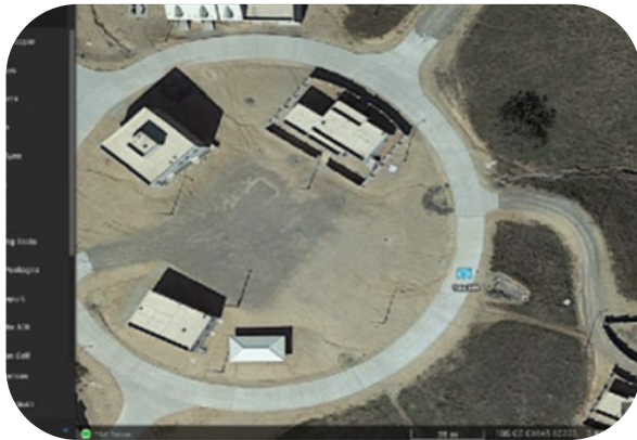
G-01: Yotta Navigation used an ad-hoc network to visualize CoT data on ATAK devices while deployed in the CACTF tunnels.