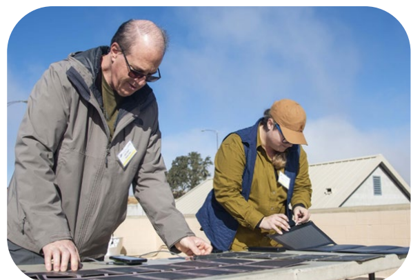
F-01: Ascent Solar readies their compact, flexible solar arrays for a collaborative experiment.