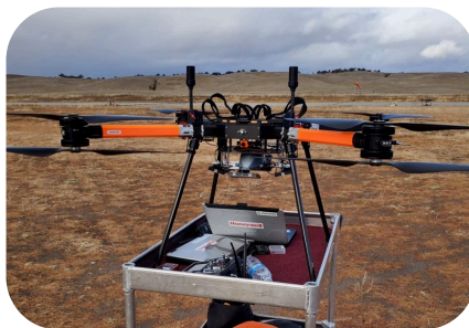
A-01: Honeywell's UAV performed several different trajectory shapes to test their performance without GPS.