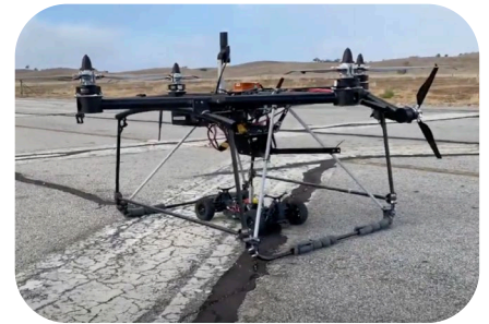
A-05: Toofon tested payload delivery by carrying a small UGV on their long-range, heavy-lift vehicle.