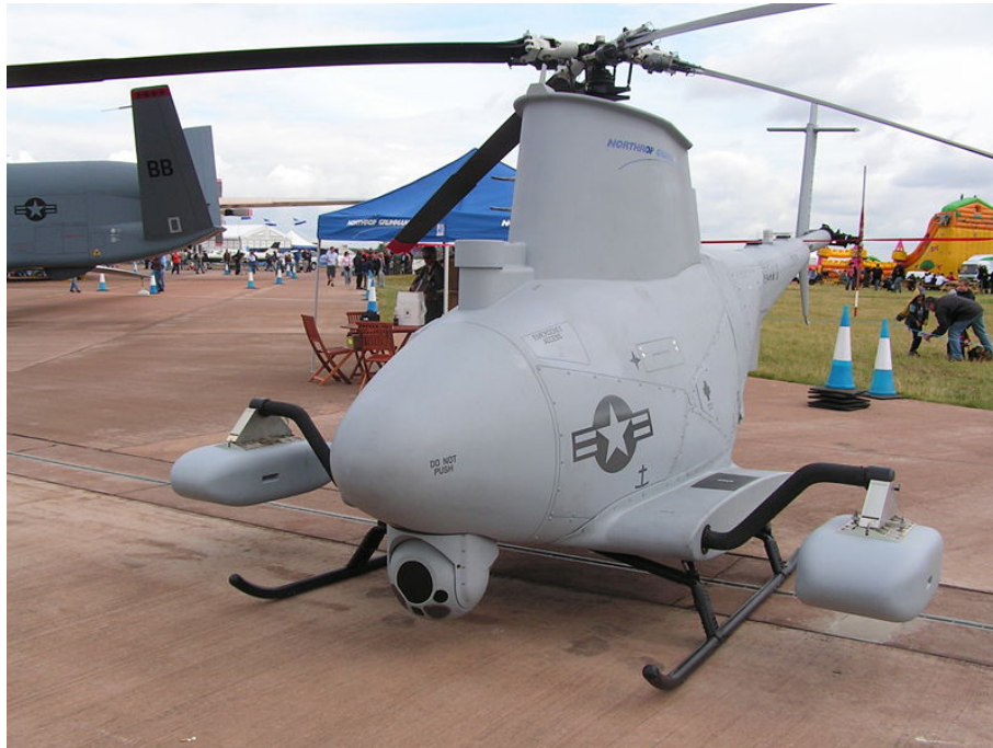
Figure 5. MQ-8B Fire Scout with Forward-looking Infrared Radar pod installed 8

positioning system (GPS) guidance and semi-active laser seeker. The Army views this versatile weapons package as ideal for the modern battlefield. In addition to its use as an armed platform, the Fire Scout can also be used to transport up to 200 pounds of emergency supplies to troops in the field.