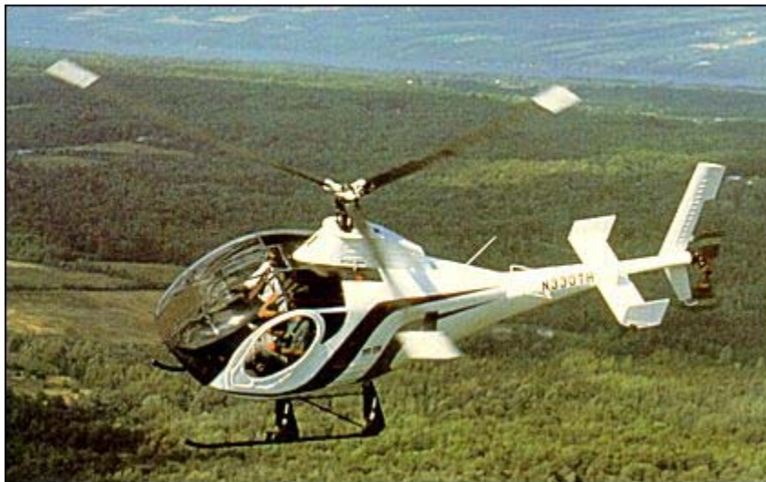
Figure 2. Schweizer 330 helicopter 4

Schweizer Aircraft, well known for the production of non-powered FAA certified gliders, has designed and built aircraft for over fifty years. In 1986, the Schweizer company acquired from McDonnell Douglas the production and manufacturing rights to the Hughes 300 helicopter, which it had been building under license since 1983. In 1987, Schweizer announced it was developing an improved turbine powered version of the Hughes 300 model, the Schweizer 330. The 330 was designed to fulfill a variety of roles including utility, law enforcement, observation, patrol, photography, transport, agricultural and training. The first deliveries of the Schweizer 330 took place in mid 1993. 3