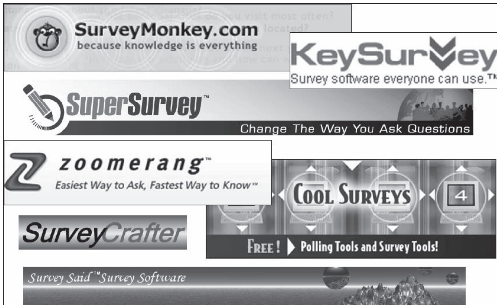
Figure 11.2 Banners for various Internet survey software (accessed January 2007)

There are many ways to draw samples from a population – and there are also many ways that sampling can go awry. We intuitively think of a good sample as one that is representative of the population from which the sample has been drawn. By ‘representative’ we do not necessarily mean the sample matches the population in terms of observable characteristics, but rather that the results from the data we collect from the sample are consistent with the results we would have obtained if we had collected data on the entire population.