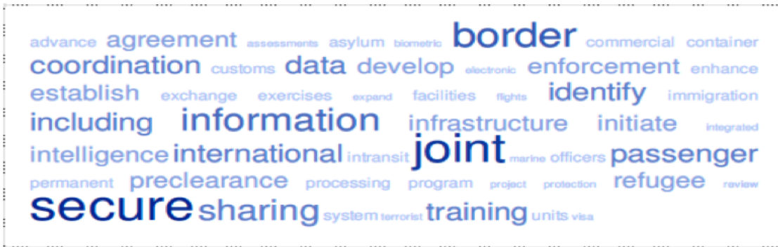
Figure 1. Smart Border Declaration and Action Plan word cloud