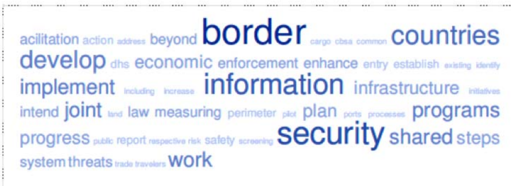
Figure 3. Beyond the Border Action Plan word cloud