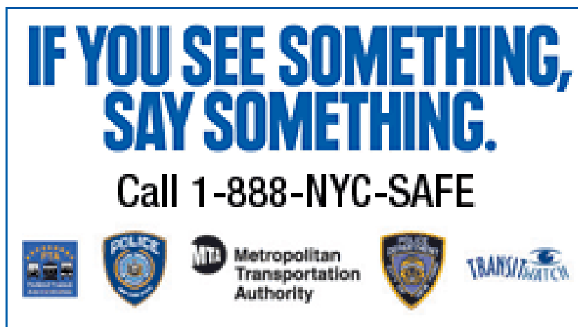
Figure 4. "If You See Something, Say Something" Advertisement.